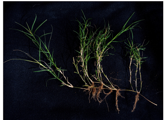
Vegetative bermudagrass showing how it spreads via above ground stems called stolons that root at the nodes. The low growth habit of bermudagrass allows it to tolerate closer grazing than traditional cool season grasses like tall fescue and orchardgrass.