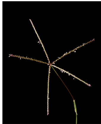
Seedhead of bermudagrass