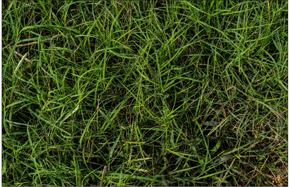
Bermudagrass is a fine-leaved sod-forming forage well-suited for pasture and hay. Shown is a top view of bermudagrass four months after establishment in Lexington, Kentucky. This stand was established from seed for horse pasture. Seeded types of bermudagrass are more winter-hardy but less palatable than sprigged types.

Cultipacking after seeding further ensures good contact of the seed with the soil.